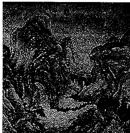
WHANG INKIE Pla Mountain 09-188, 2009 Plastic blocks mounted on panel in two parts Overall: 192 x 192 cm